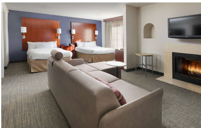
The Sonesta ES Suites Albuquerque studio suite with two double beds accommodates three with the very comfortable fold-out couch