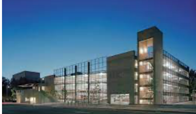
The Cornell Parking Structure on the UNM Campus

Once you've parked, note your parking stall number. Go to a pay station. There are two on every level. Enter your stall number and use a debit or credit card for your payment. To pay in cash, go to the third level where there are two cash machines. However, those machines do not dispense change. Be sure to bring exact change for your $8.00 parking fee.