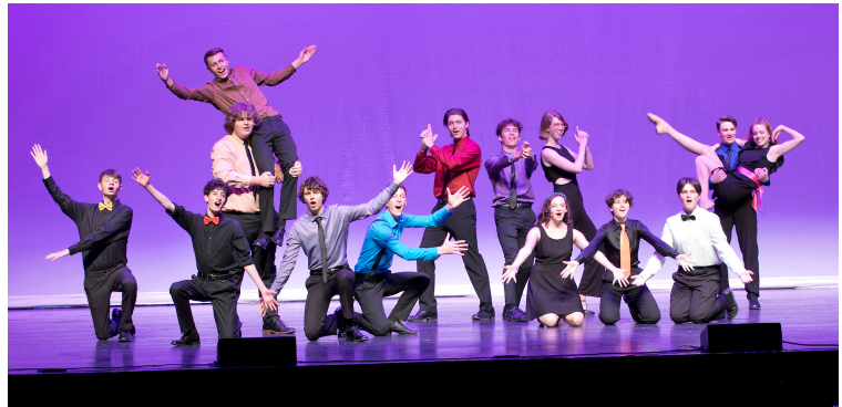
Dressy blacks in our 2022 opening number.

All Best Actor, Best Actress, Best Supporting Actor, and Best Supporting Actress nominees, and Directors Choice Chorus members must bring what we refer to as a Dressy Blacks outfit. It is very similar to the Dressy Blacks required by the Jimmy Awards. This outfit is used in the opening and closing numbers, for the Act One finale, and for Best Actor and Best Actress solos.