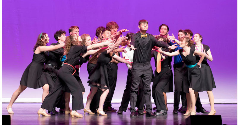
Our opening number from the 2022 Enchantment Awards.

The Enchantment Awards is the biggest celebration of your work in your high school theatre program in New Mexico. We recognize individual artistry in performance, honor teachers and your schools' commitment to theatre education, and celebrate the accomplishments of drama students (like you) and teachers from all over our state.