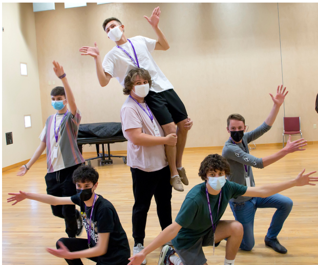
Students from the 2022 Enchantment Awards rehearse the opening number.

Students leave our program with greater confidence, improved skills, more friendships, and better preparation for the world at large. High school theater programs also provide these benefits, of course. Our program expands the horizons and opportunities for those benefits.