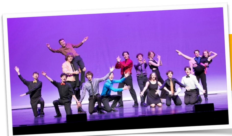
Best Actor and Best Actress nominees perform in the opening medley at the 2022 Enchantment Awards.

Adjudicators will receive two complimentary tickets to the Enchantment Awards on Friday, May 2, 2025. Please save the date now. More information about how to claim your tickets will be sent in April.