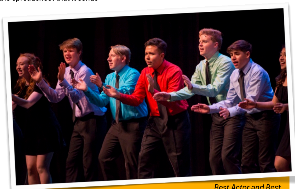
Best Actor and Best Actress nominees sing their opening medley during our 2017 show, which was still called the Popejoy Awards. We changed the name to the Enchantment Awards in 2018.

TIP! Keep the school's program book, if they offer one, to help you with spelling and other references you might wish to add to your feedback.