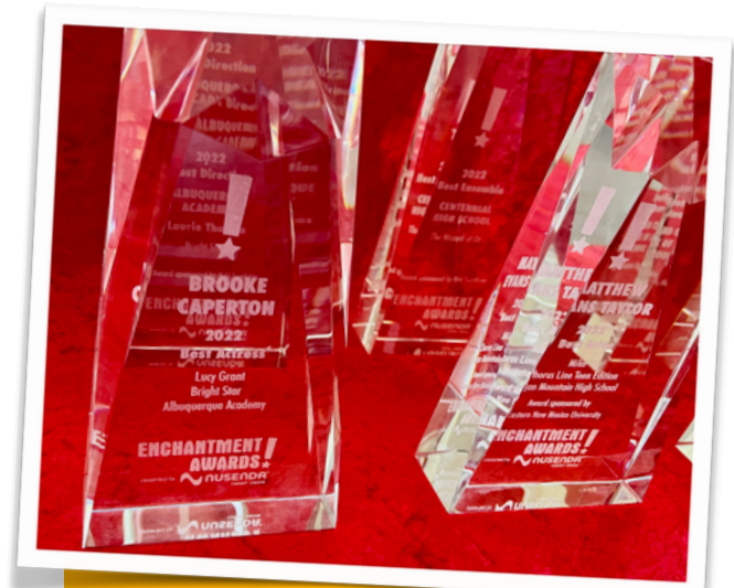
The engraved crystal trophies we give to all award winners